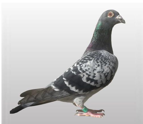
Lot 5. Son of Proteche & Dynasty