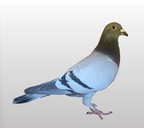
Lot 8. Janssen Inbred to SCALLOP