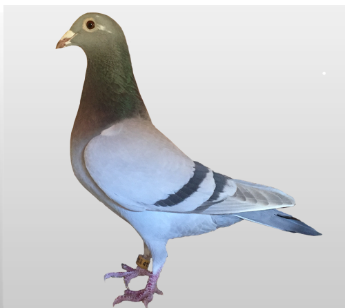
Lot. 4 Houben/ Janssen