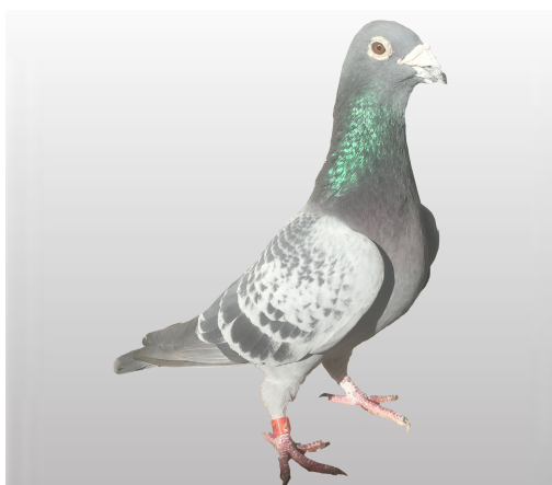
Lot 27. DeWeerdt Son box 28 Pair