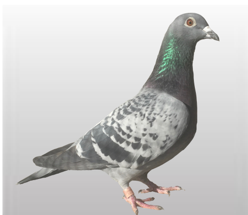
Lot 28. DeWeerdt/Ince