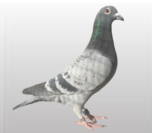
Lot 20. 4 th Open 700Miles